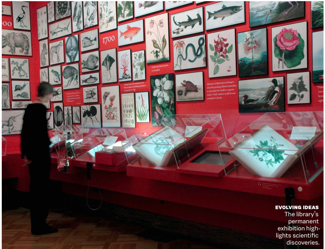
EVOLVING IDEAS The library’s permanent exhibition highlights scientific discoveries.

Cheer on your pick at this thoroughbred race track or take a tram ride through the stables.